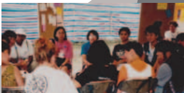
It's Her Right Asia Safe Abortion Partnership 13 minutes