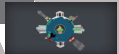
The Road to Development Justice APWLD 7 minutes