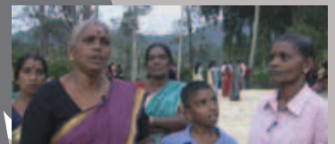
Where are Women in Local Government? Women and Media Collective 9:31 minutes