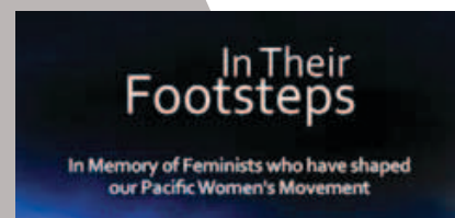
Pacific Women's Conference Tribute Video Femlink Pacific 10 minutes