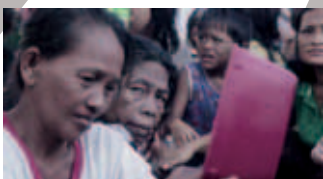
Status Update - Women, Conflict and Social Media JERA International, Isis International, APWW 15 minutes