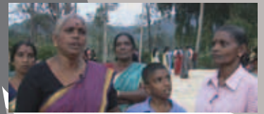
Where are Women in Local Government? Women and Media Collective 9:31 minutes