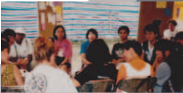
It's Her Right Asia Safe Abortion Partnership 13 minutes