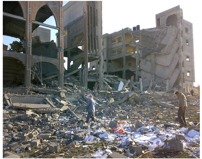
The Gaza war was among the deciding factors in the recent Israeli elections.