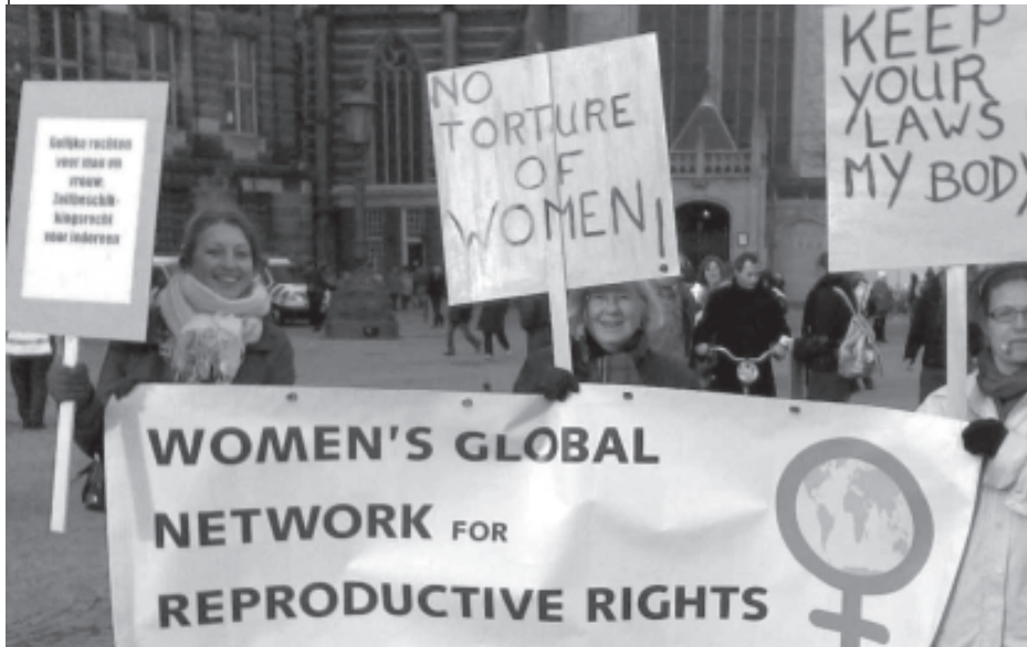
WGNRR in a mobilisation in December 2007.

services; and (4) train and equip health service providers to ensure that abortion is safe and accessible in circumstances where abortion is not against the law.