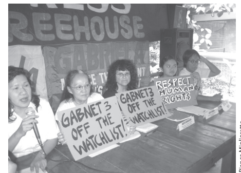
Three members of the GABRIELA Network USA (GABNet), during a press conference on August 11, 2007, have nothing to blame for being barred from leaving the Philippines but the implementation of the Human Security Act.

Sources: "Immigration holds 3 women for 'links' to Afghan's Taliban" from Inquirer.net , posted on August 16, 2007, < http://newsinfo.inquirer.net/breakingnews/nation/view_article.php?article_id=82891 >. "US based Gabriela exec stopped from leaving; HSA cited" from Inquirer.net , posted on August 12, 2007, < http://globalnation.inquirer.net/news/news/view_article.php?article_id=82026 >.