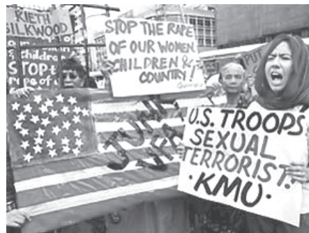
Protesters call for justice for the violation of a woman's right and a nation's sovereignty.

So the issue in this case is, one, the interpretation of that particular provision; and two, the way the provisions were formulated.