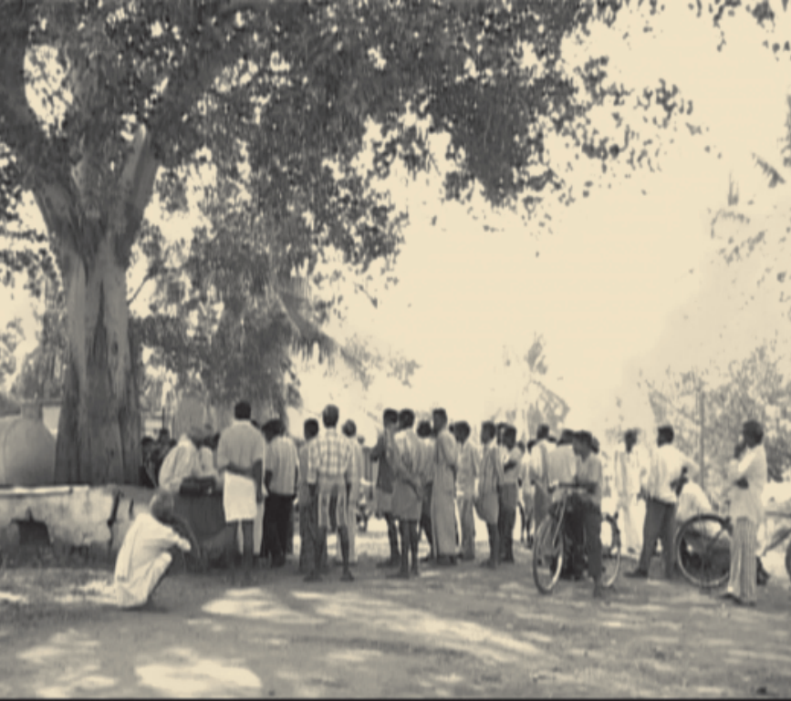
Village men gathered at a village shop to listen to a women's community radio programme.